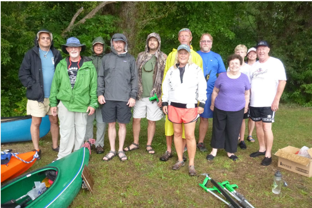
6 River Sweep – Sturgeon River with Sturgeon River Sweepers