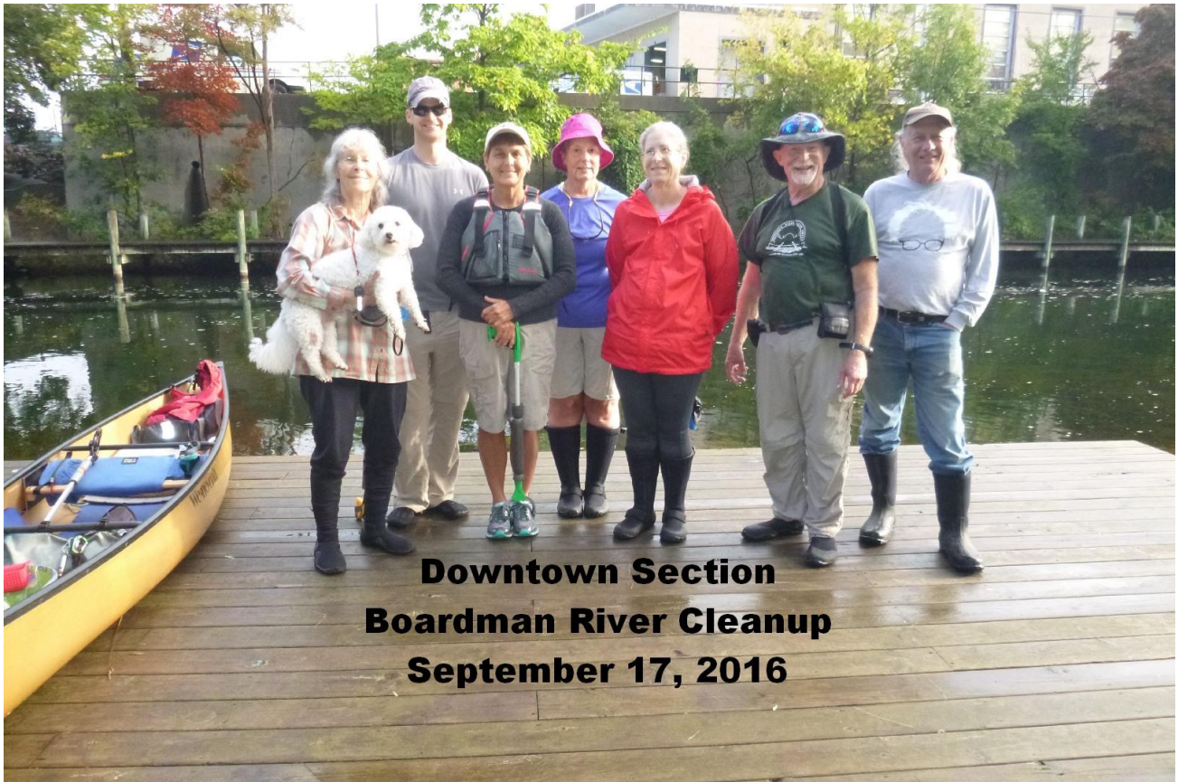
Downtown Section Boardman River Cleanup September 17, 2016