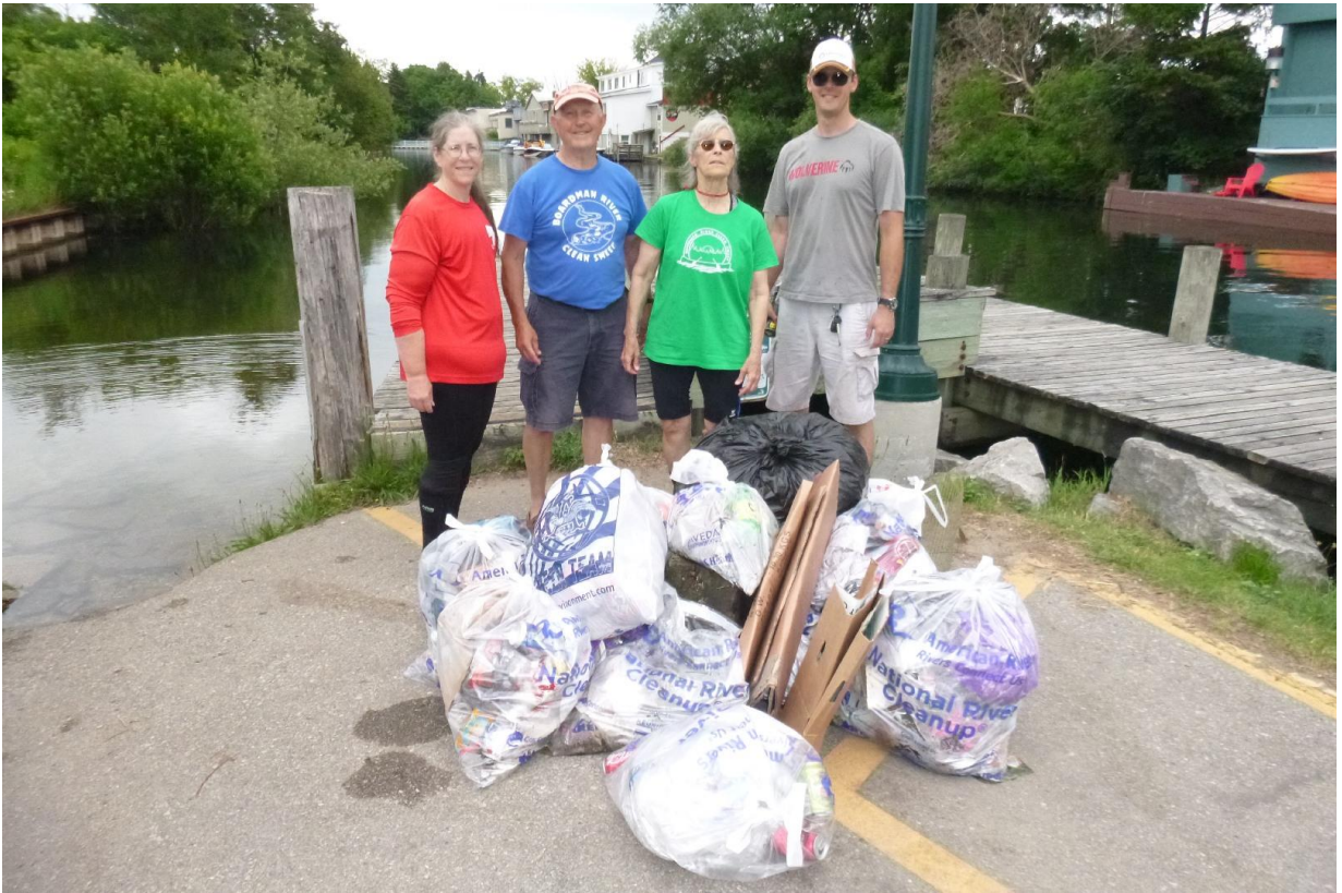
Downtown Boardman River - National Cherry Festival Cleanup