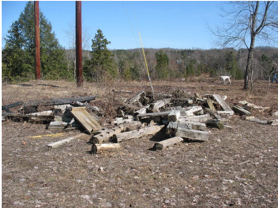
We started with this illegal dumpsite near Sabin Pond in mid-March.

We did 25 separate projects in 2016. These are but a few of the photos of the work we did this season on the Boardman and many other rivers in NW Lower Michigan.