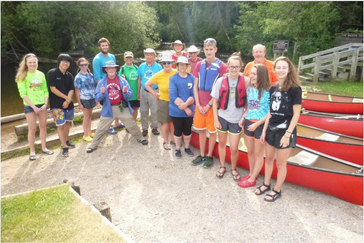
South Branch – AuSable River Cleanup