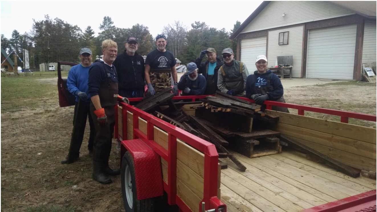
Upper Manistee River Deck Removal